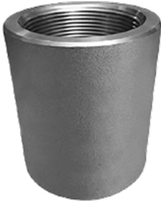
* Reference photo