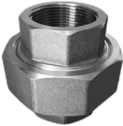
* Reference photo