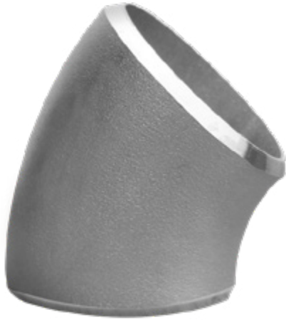
* Reference photo

Material: ASTM A403 304L Design: ASME / ANSI B16.9 Ends: Butt Welded Schedule: SCH 10S