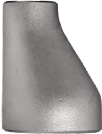
* Reference photo