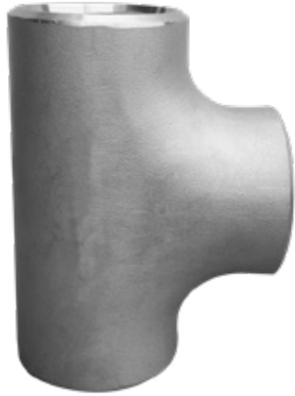
* Reference photo

Material: ASTM A403 304L Design: ASME / ANSI B16.9 Ends: Butt Welded Schedule: SCH 10S