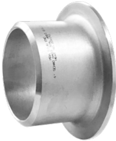
* Reference photo

Material: ASTM A403 316L Design: ASME / ANSI B16.9 Ends: Butt Welded Schedule: SCH 10S