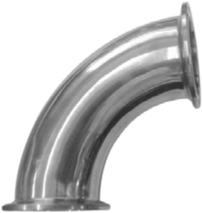
* Reference photo

Norm: ASTM A270 Standard: 3A Material: SS 304 Ends: Clamp Polish: 320 Grit Inside / Outside Tolerances: The wall thickness at any point shall not vary more than 12.5 %, from the specified wall thickness.