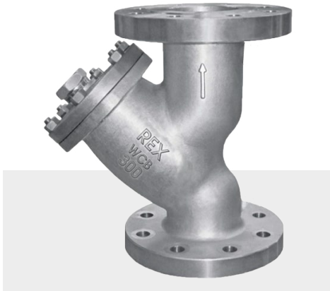
* Reference photo

Body and Cover Cast Steel: ASTM A216 WCB Class 300 Steel Valves: ASME B16.34 Flange dimensions: ANSI B16.5 RF Face to Face dimensions: ASME B16.10 Screen: Stainless Steel 304 (Opt. 316) Mesh 40 Hydrostatic Testing API 598