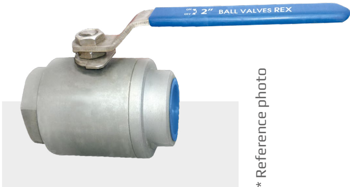
* Reference photo

Steel Body type ASTM A105 Ball: SS 316 (Optional SS 304) Seats of RPTFE or POLYFILL Thread ends NPT ANSI/ASME B1.20.1 Memoryseal seating technology Two pieces body. Full Passage. Blow-Out-Proof Stem Maximum Working Pressure: 1/4" - 1" 2000 PSIG 1 1/4" - 4" 1500 PSIG Maximum temperature operation: RPTFE -20°C (-4°F) to 150°C (302°F) POLYFILL -28°C (-20°F) to 240°C (464°F) Tests according to API 598