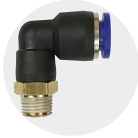
Includes air connector